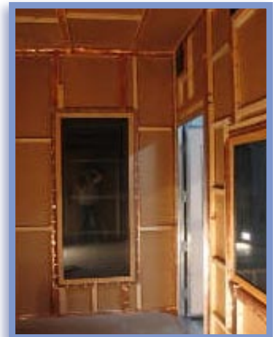
Custom MRI Shielding