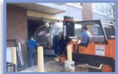
The installation process

RF shielding is just one of the services ICS provides. We have been in the imaging equipment business since 1998. Our employees and management have well over 20 years experience selling, servicing, and installing MRI and CT equipment. Our technical background is our strength. We aren't just salesman trying to make a quota! We are professionals with engineering experience and knowledge that enables us to provide consulting and support to our customers.