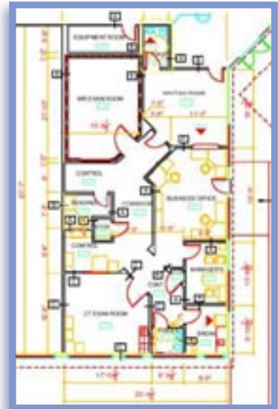
Site Planning Service

ICS personnel provide a true turn-key MRI installation—start to finish. All installations are performed according to OEM specifications, ensuring that your imaging equipment will perform up to the same standards as when it was first manufactured.